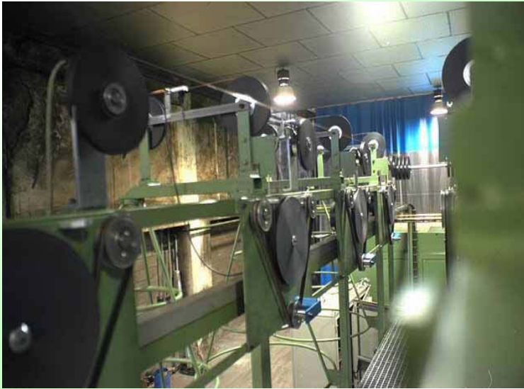
BRAKING SYSTEM ON SINGLE WIRE WITH POSSIBILITY TO SEE THE REAL TENSION